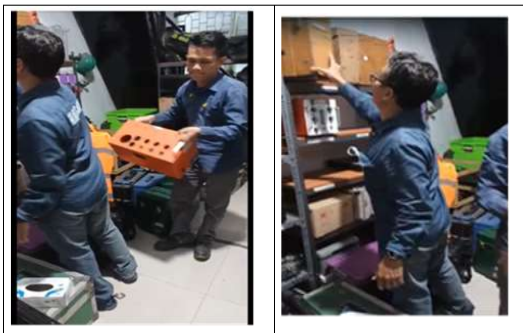
Figure 1. Activities in the Physics Laboratory

Based on information from 3 informants, it is known that the K3 hazards in the physics laboratory are physical hazards from heavy equipment, the danger of poor lighting, and narrow spaces. The risks are falling equipment, being hit by equipment, and being hit. There is no documentation in the form of procedures owned by the physics laboratory. Therefore, in preparing sampling tools and intermediate checks based on experience gained from previous seniors. To prepare tools based on requests only. There is already a tool voucher from ISO 17025 2027. The sampling officer prepares a tool voucher to be given to the physics supervisor. After that, the physics supervisor hands it over to the tool officer to issue the tool according to request. Here are some photos while preparing the equipment and doing intermediate checks: