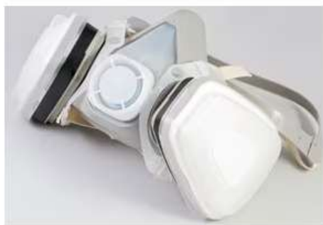
Figure 3. Types of Half Mask Respirator (58)

In addition, the use of protective clothing (coveralls) is also recommended to anticipate chemicals that are spilled and affect the entire body, especially the head area. According to research by Christian J. Kuster (2024) The results of the study showed that wearing work clothes protective clothing (coverall) offers substantial exposure reduction efficiently reduces chemical exposure and mitigates potential health risks to workers when used properly. (59)