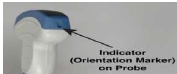
Picture 1. Transducer marking indicator

The structure within the thorax cavity can be visualized by maintaining the transducer along the longitudinal axis (sagittal). Anatomical landmarks can help the examination, especially in performing pleural punctures. The right pleural surface is limited by the diaphragm and liver, while the left side is limited by the diaphragm and spleen. The transducer can be placed at multiple locations along the thorax , depending on the anomaly of the location being examined.