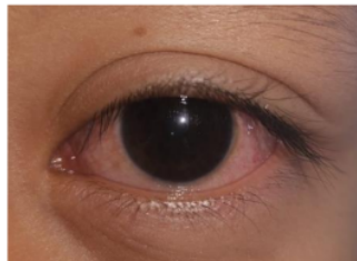
Figure 2 Left eye, conjunctival injection was found without other structural abnormalities of the eye.

Temporary management of patients in this case can be given Levofloxacin 0.5% antibiotic as a broad-spectrum antibiotic prophylaxis therapy due to bacteria that is in accordance with the consideration that microbiological examination has not been carried out as well as supportive therapy such as Sodium Cl + Potassium Cl 0.6 mL for patient's eye complaints.